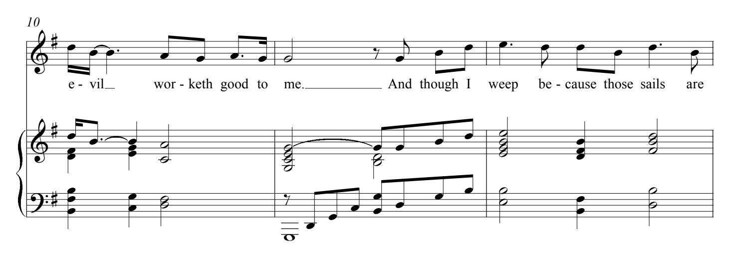
Copyright 2003 © Monroe Street Music